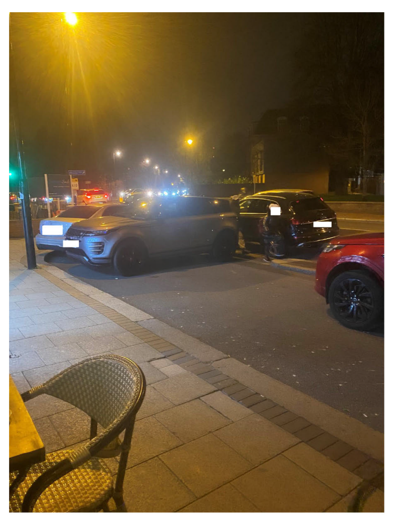
On the picture my car is red car, the Audi and Range Rover evoque is blocking the forecourt. Both owner and customer from hairdresser.